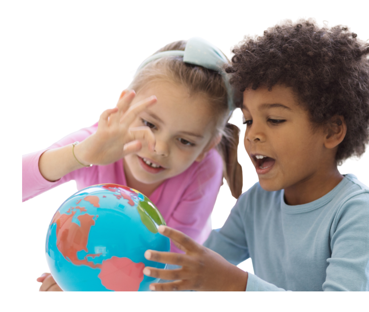
Empowering your ESG Journey